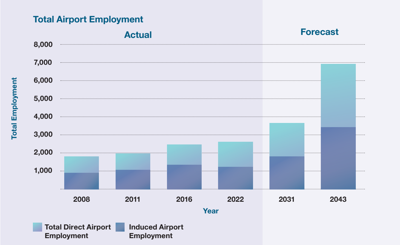
Figure 3.2: Actual and expected case forecast totalemployment 2008 – 2043: Source: Hudson Howell.